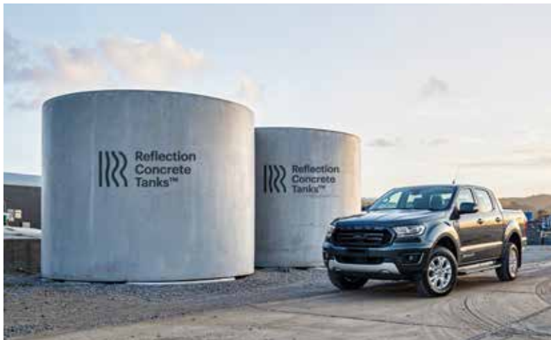
Commercial and Residential size tanks available.