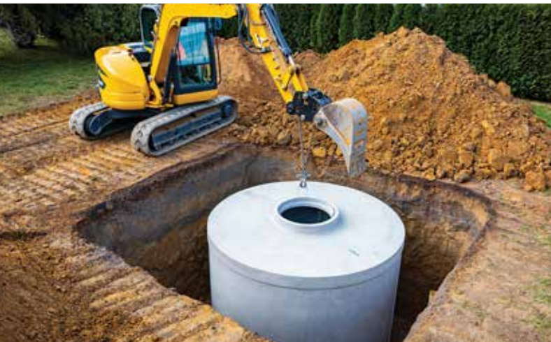
Fully buried with only the manhole riser and lid visible.

Ideal for use with 300mm soil cover and small vehicle loads up to 2500kg, or installations with 300mm to 800mm soil cover—no vehicle surcharge required.